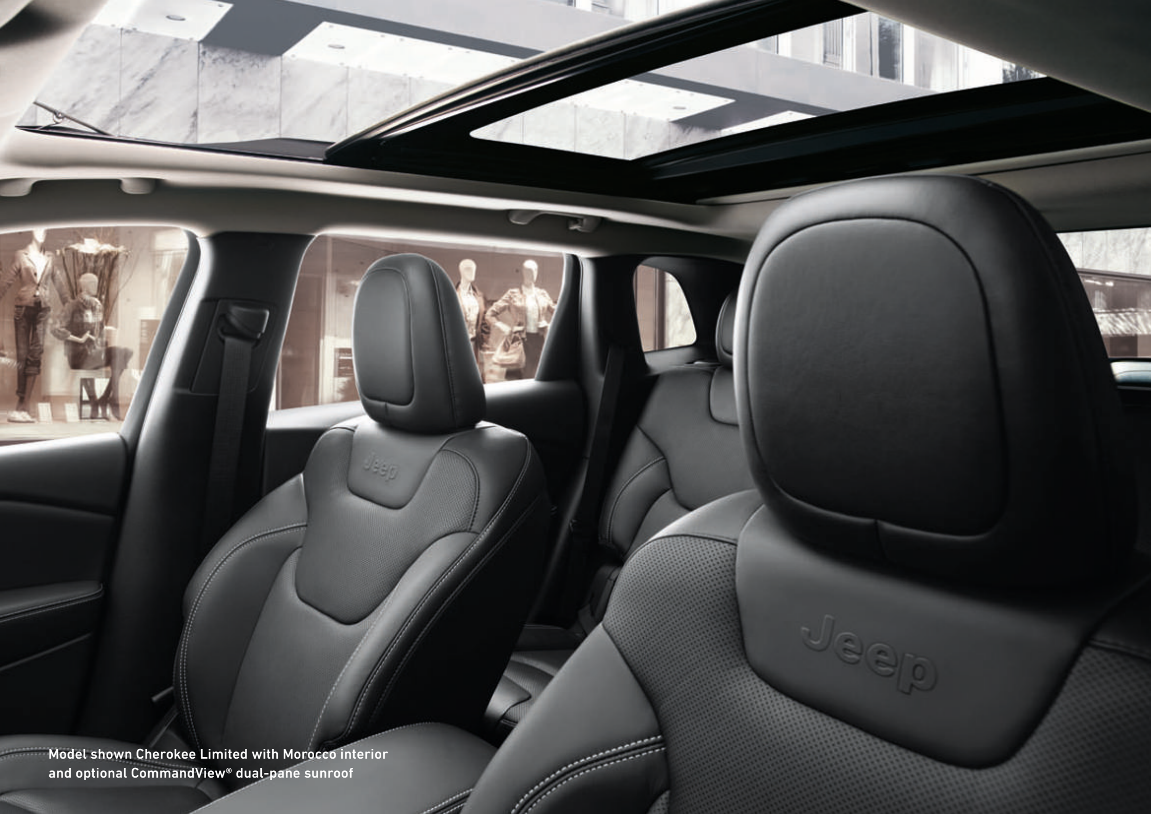
Model shown Cherokee Limited with Morocco interior and optional CommandView® dual-pane sunroof