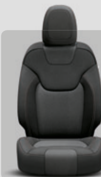
Morocco Black Cloth

Colours, trim & option combinations are subject to availability