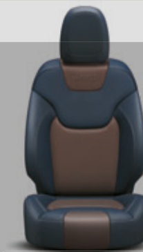
Vesuvio Jeep Brown / Indigo Blue Nappa Leather