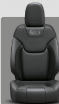
Black Nappa Leather with Overland stitching