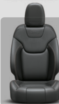
Morocco Black Nappa Leather