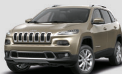
Light Brown Stone

Colours, trim & option combinations are subject to availability