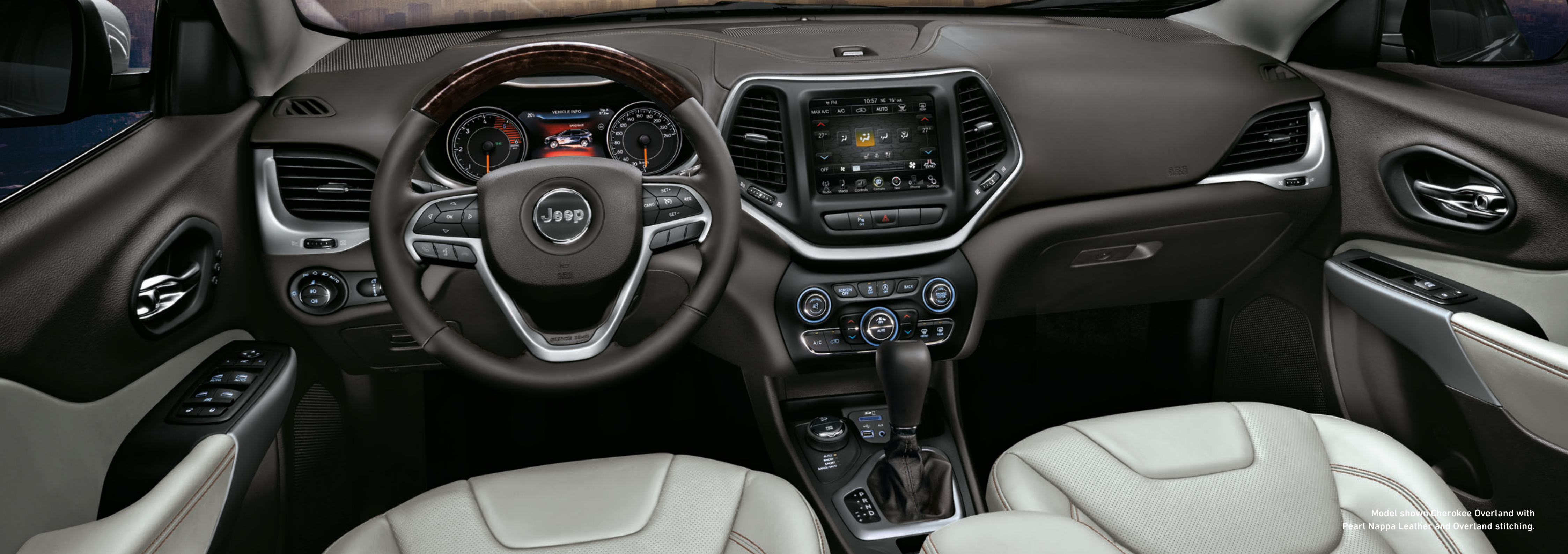
Model shown Cherokee Overland with Pearl Nappa Leather and Overland stitching.