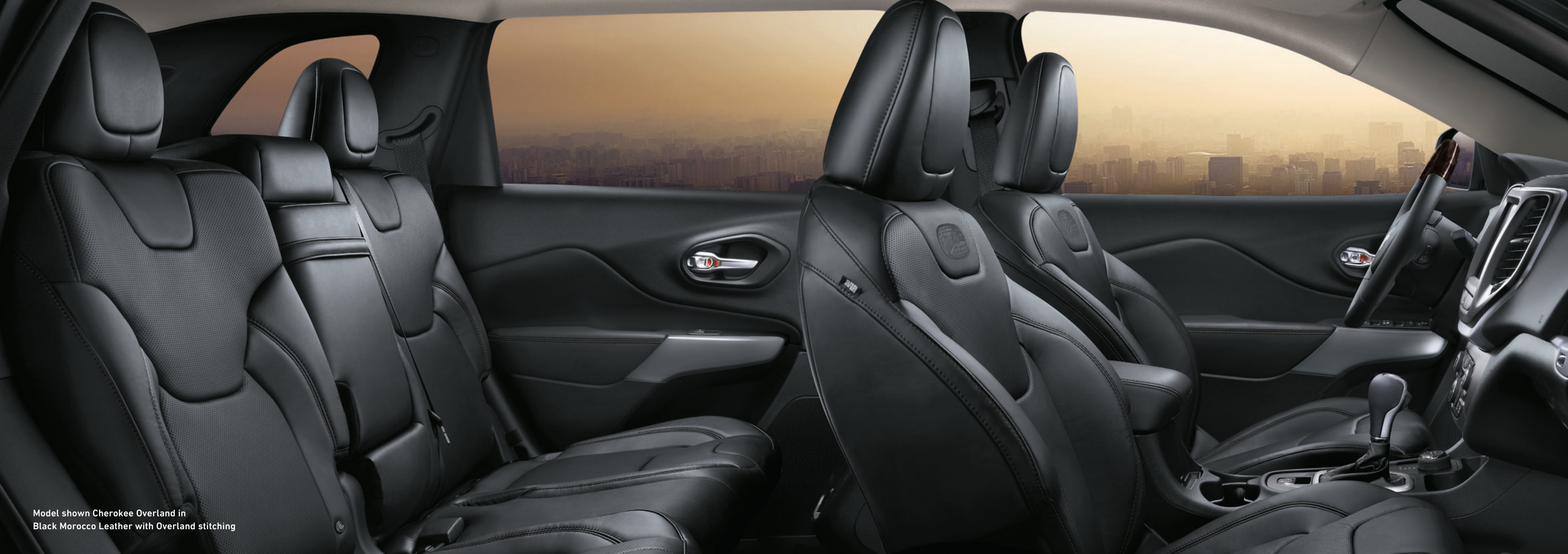
Model shown Cherokee Overland in Black Morocco Leather with Overland stitching