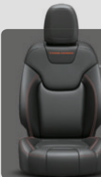
Morocco Black Nappa Leather with Red accent stitching

Non-black interiors have limited availability and may require a factory order.