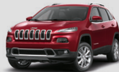
Deep Cherry Red