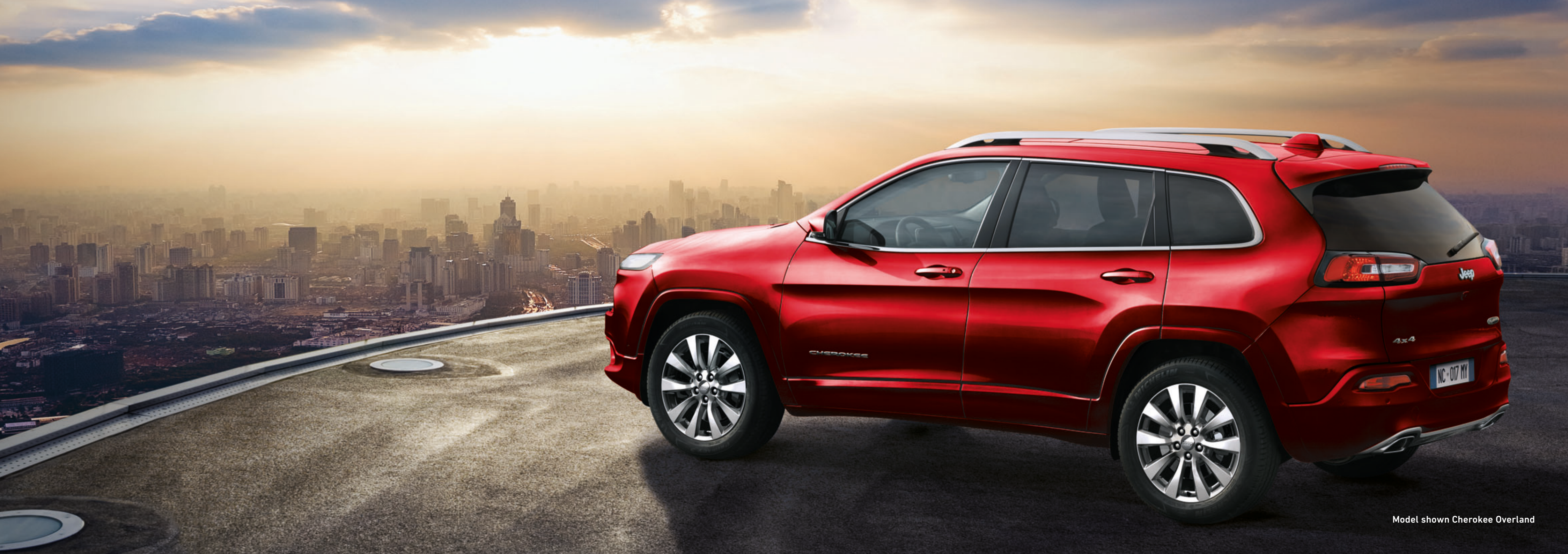
Model shown Cherokee Overland