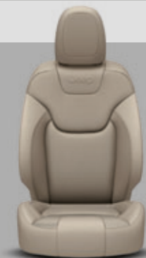
New Nepal Light Frost Beige Nappa Leather