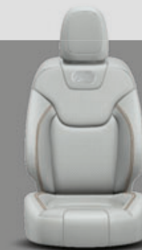
Pearl Nappa Leather with Overland stitching