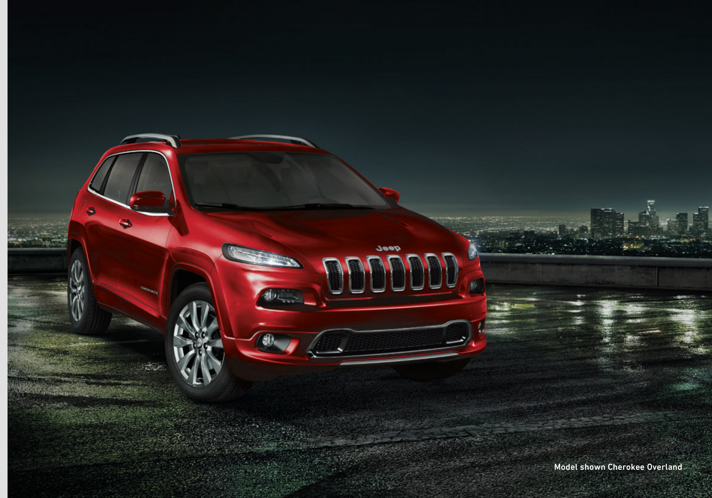
Model shown Cherokee Overland

The Jeep® Cherokee successfully combines a futuristic design with legendary heritage. Its aggressive wheel-to-body proportion and commanding road presence looks impressive even to the most demanding eye. Developed by European designers, the fluid, sleek exterior lines highlight the efficient upper body of the Cherokee. The rugged, protective lower body conveys the legendary capability that is a characteristic of every Jeep®, making the Cherokee efficient and capable on varying terrains and weather conditions. The new Jeep® Cherokee Overland top of the range version features body coloured lower fascia and side skirts, offering a new level of sophistication.